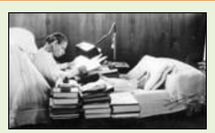
True Perfection in Oneself

"In a general and almost absolute way anything that shocks you in other people is the very thing you carry in yourself in a more or less veiled, more or less hidden form, though perhaps in a slightly different guise which allows you to delude yourself. And what in yourself seems inoffensive enough, becomes monstrous as soon as you see it in others.